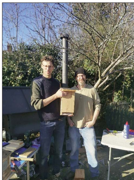
Bird & Bat boxes