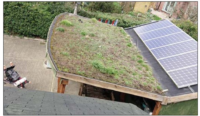
The living roof on the kitchen is doing well

The two Community Engagement Gardeners (Beth Astle and Tom Wells) have worked industriously during the year to keep the garden in such good shape. On the days that they worked in the garden, the garden was also open to the community, which enabled them to work with groups of volunteers e.g. from Crisis, and individuals. People were able to volunteer for a variety of gardening tasks to suit different abilities, or just enjoy being in the garden, so vital for people's wellbeing.