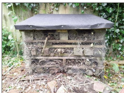
Bug motel got a make-over