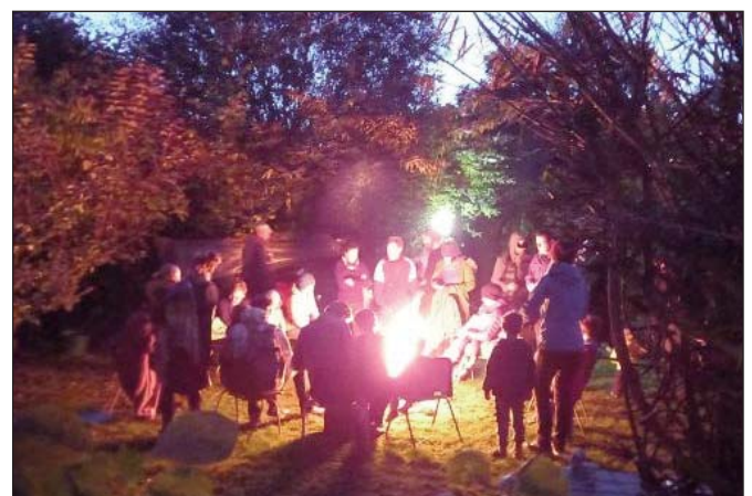
Fire-side fun at our Festival of Fire & Light 2021

The start of 2022 saw the garden begin to work with Oxford Brookes University to host two work placement students from the Faculty of Humanities and Social Science. The actual work placements took placement in April 2022 so further details will be included in the next annual report.