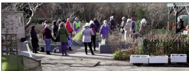
The weekly singing group was such a success we are bringing it back this year