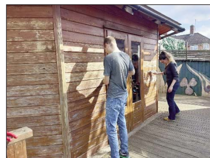
Octagonal got re-varnished