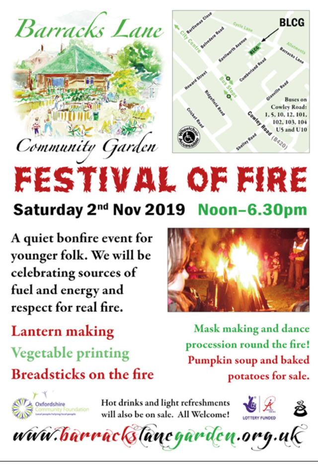
BLCG posters (and flyers) designed by Stig

Because of grants, community fundraising, donations, trustee and friends gift days we have been able to celebrate the renewal of the infrastructure of the Garden. We have focussed on keeping the Garden open for drop-in sessions every Saturday and created a warm welcome to visitors and volunteers alike. Special one-off workshops were delivered to the First/Second Steps Groups to offer high quality activities and trips.