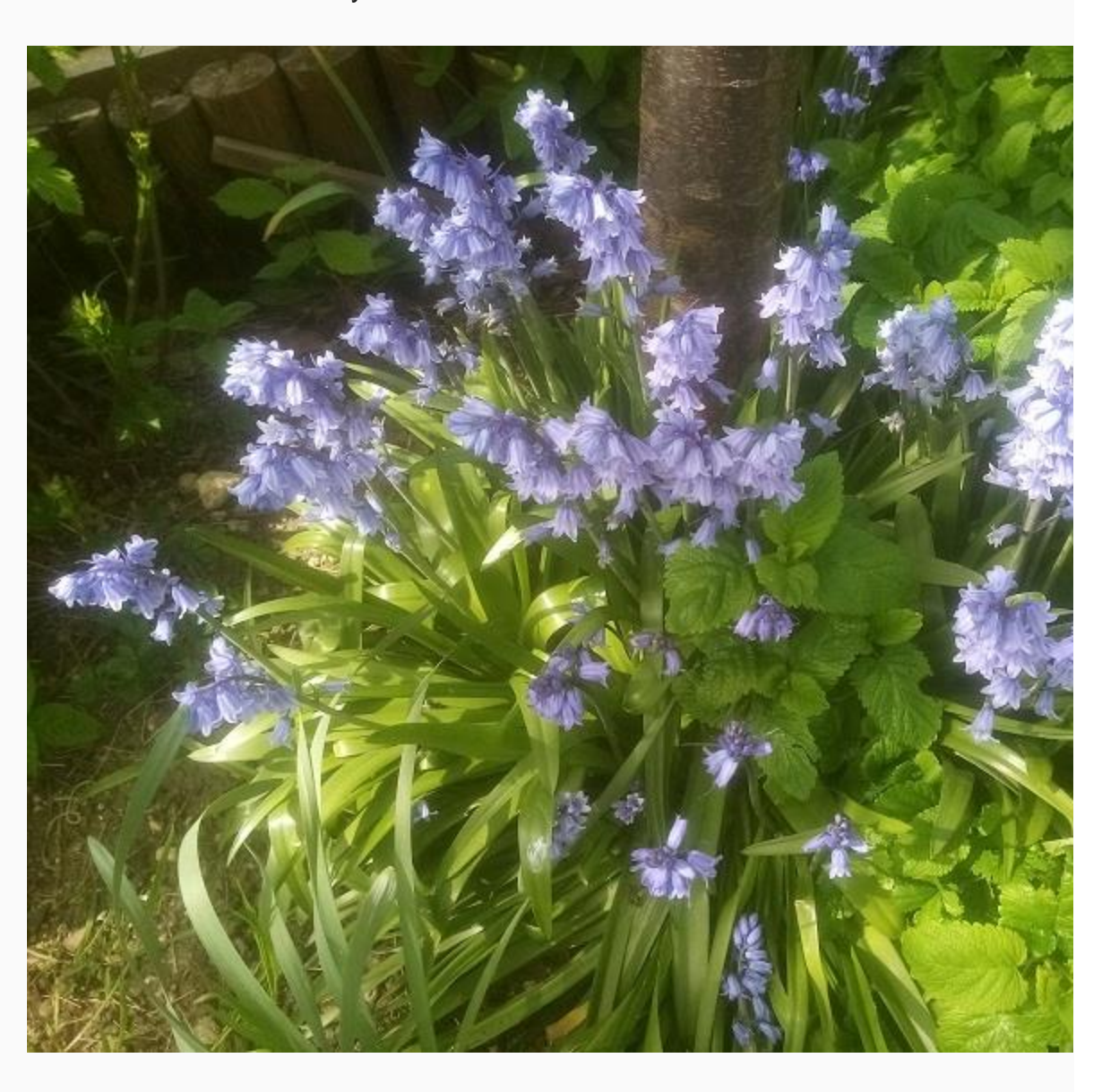
Best wishes Barracks Lane Community Garden