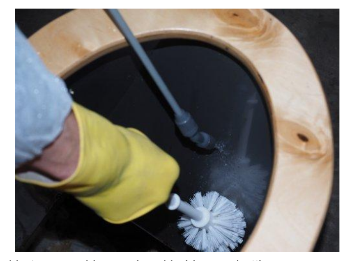
A pump sprayer is good but you could use a hand held spray bottle

Clean the ceramic urinal bowl with a multi surface cleaning solution and flush with approximately a litre of clean water.