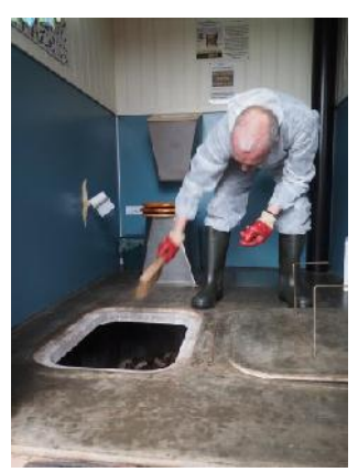
Raking the compost towards the door end and sweeping the flange before refitting the hatch.

During this operation the progress of composting can be checked and if the compost is dry it will be beneficial to add sufficient water to dampen the pile. Try to distribute this evenly. If too wet add more soak and rake in to take up the excess liquid. Leave the rake in the vault.