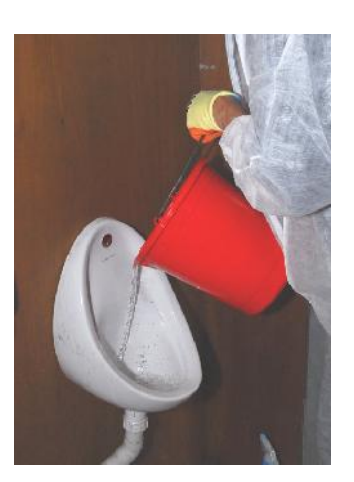
Wear suitable protective clothing for all cleaning operations