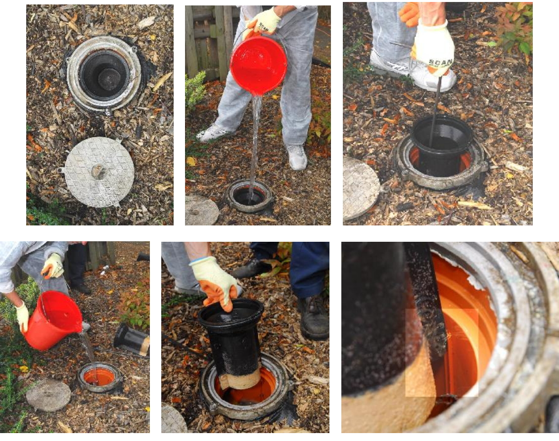
Wear protective clothing and clean your hands afterwards.

Once a year, or after clearing a blockage in the urine gutter, it is advisable to check and clean the back inlet gully leading to the soakaway. Remove the three screws holding on the lid. Tip a bucket of water down the trap to sluice through. If the water does not disappear quickly then pull out the black plastic inner sleeve by hooking the gully rod provided under the bottom edge. Clean and refit the black inner making sure the splines locate correctly in the side slots.