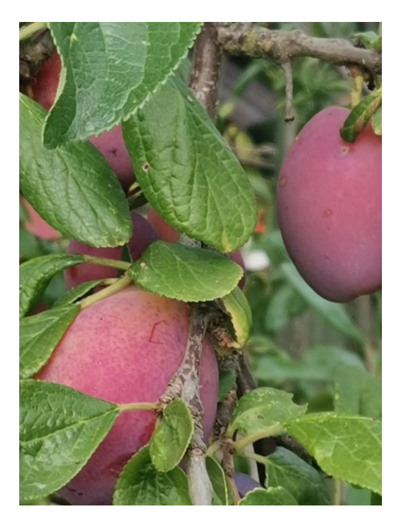
Small bookings in the garden

If you have any gardening tips or seasonal recipes that you'd like us to share before the event, please email barrackslanegarden@yahoo.co.uk and we can put them on our <u>Facebook</u> and <u>Instagram</u> pages.