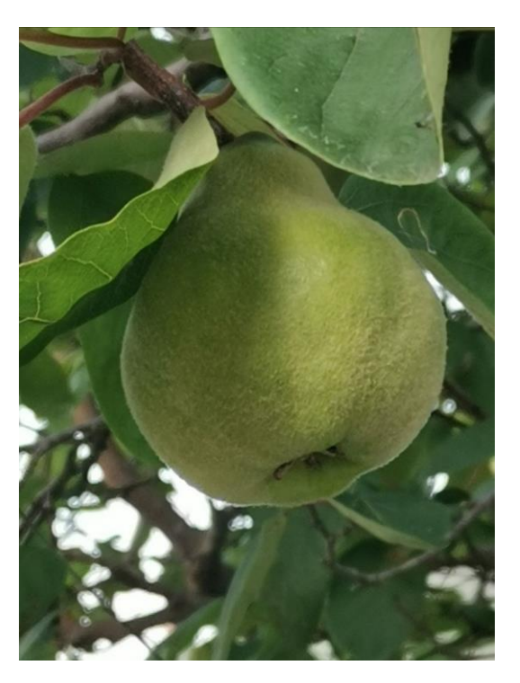
Gardening tips or seasonal recipes?

If you have any gardening tips or seasonal recipes that you'd like us to share before the event, please email barrackslanegarden@yahoo.co.uk and we can put them on our <u>Facebook</u> and <u>Instagram</u> pages.